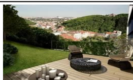
New Progresses in NOARK Europe