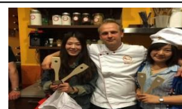
NOARK Launched a Team-building Activity