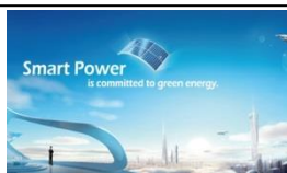
CHINT Participates in Middle East Power Exhibition