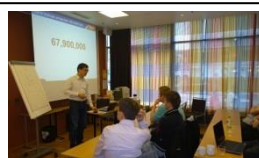
CHINT Launched Products Seminar in Europe