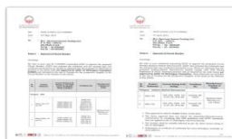
CHINT Successfully Obtained Qualification from ABU Dhabi Electricity Authority