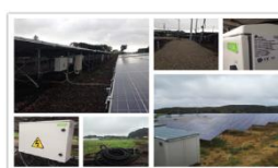
NOARK being on the Japanese Famous Magazine