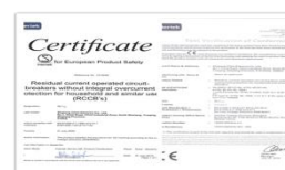
CHINT New NL1 Series to be Launched