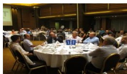
Lebanon's 2015 Annual Product Seminar Came to a Successful Conclusion