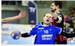
CHINT Sponsored Norway DHK Handball