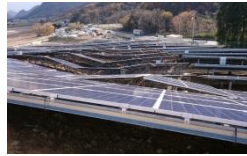
NOARK Won 4 MW PV Projects in Japan