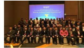
CHINT WAA Sales Conference Came to a Successful Conclusion