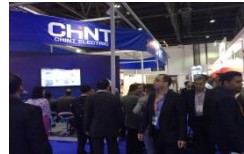
CHINT Participated in Dubai MEE 2016